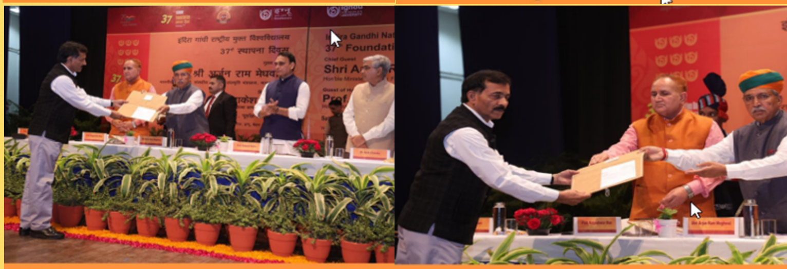
Best Centre Award to NCIDE