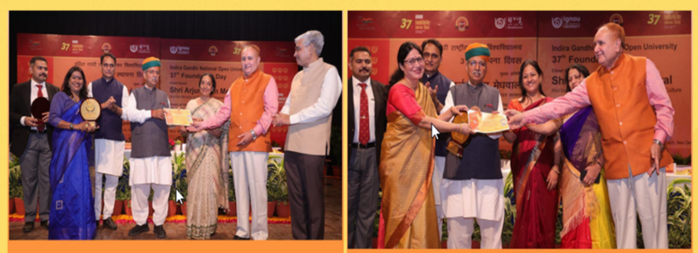
Best School Award

The University also has a practice of awarding the best performing School, Division, Centre, Unit, etc. on its foundation day ever year. Accordingly the School of Management Studies was adjudged as the Best School and the Student Evaluation Division as the Best Division on this occasion Foundation Day 2022 (19th November, 2022). The Centre for Internal Quality Assurance was adjudged as the Best Centre b on this occasion.