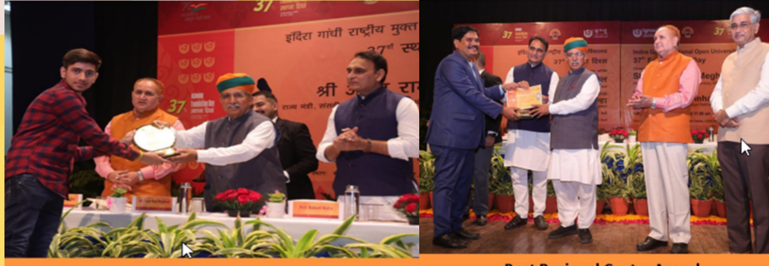
Best Inovation Award