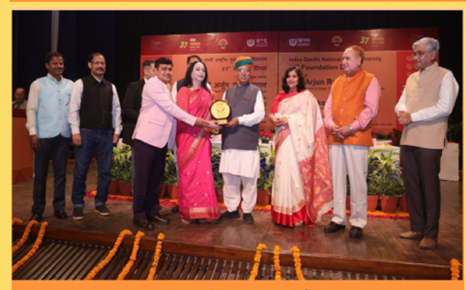
Best Regional Centre Award